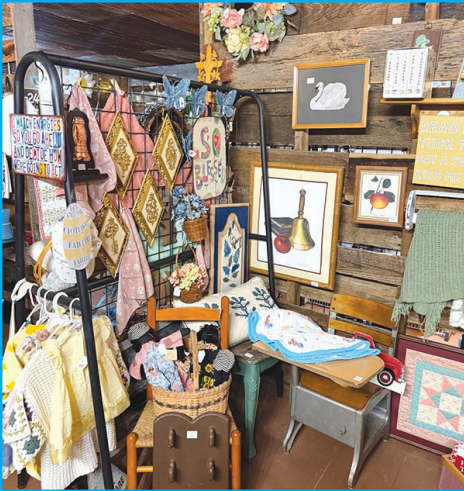
Come see what's new at The Shabby Chick Market place in Glasgow, KY.

Gilbertsville, Glasgow, Glendale, Louisville, Madisonville, Scottsville & Sturgis, KY